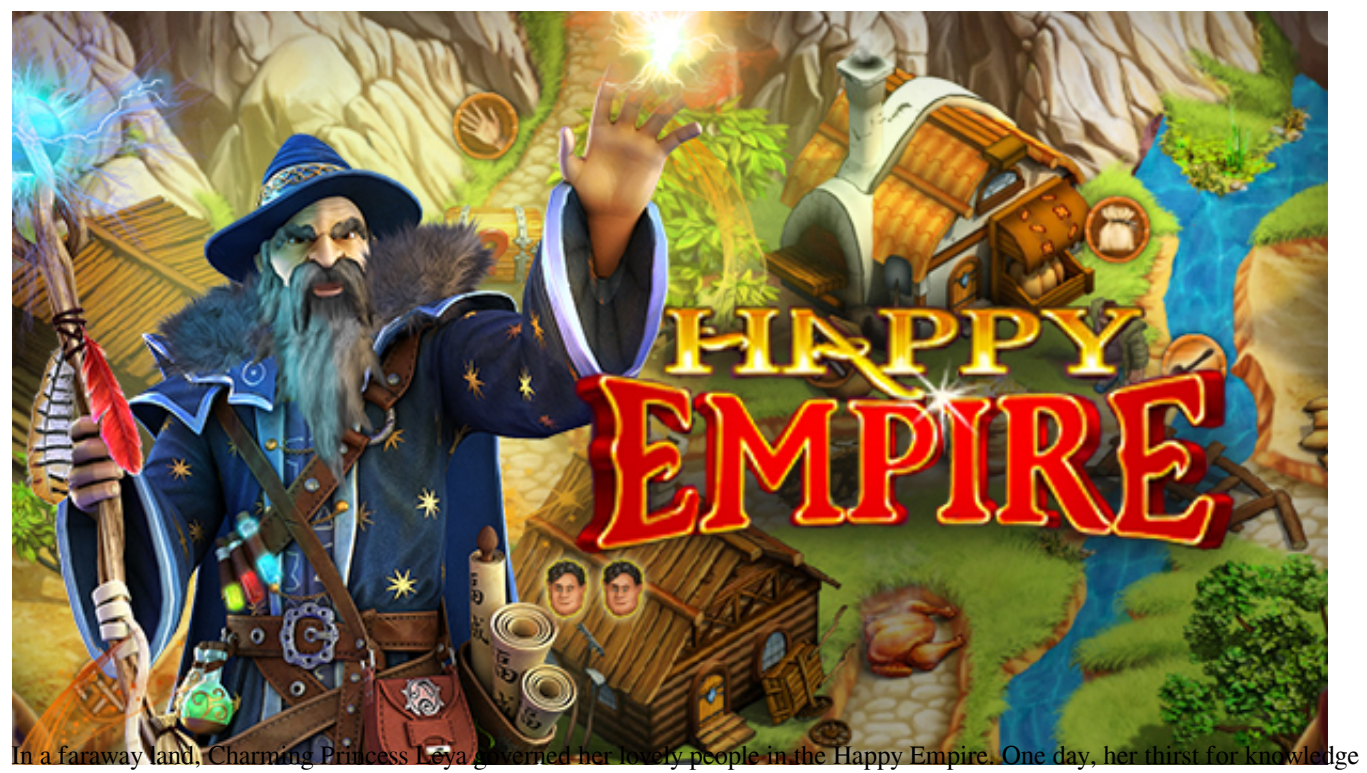
and discovery of new lands inspired her to venture on a long journey. During her absence, an evil wizard named Moramor advanced and captured the Happy Empire.

Help the princess overcome difficulties, banish the evil wizard and restore the empire!